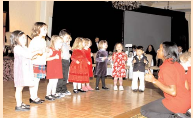
Children from YMCA Ayr lawn Program Center perform a musical number at the YMCA's Annual Dinner.